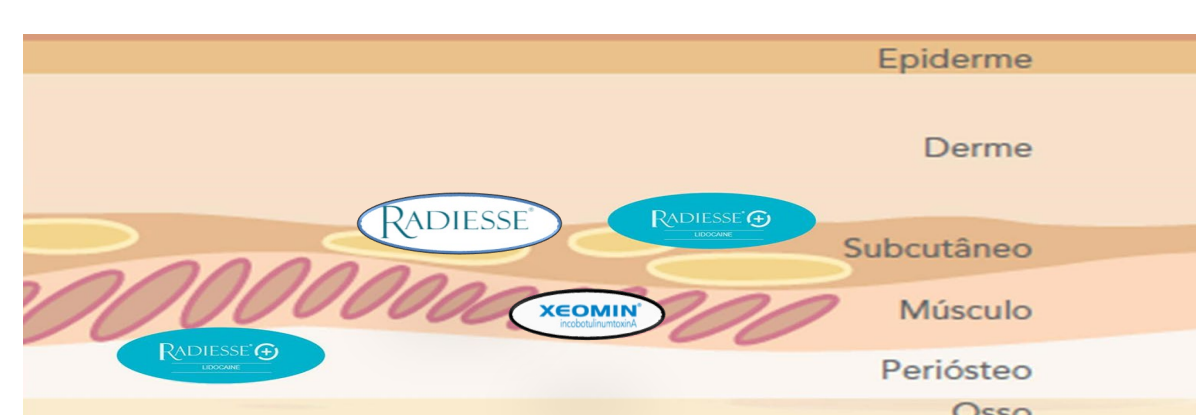
Fig.5. injection area