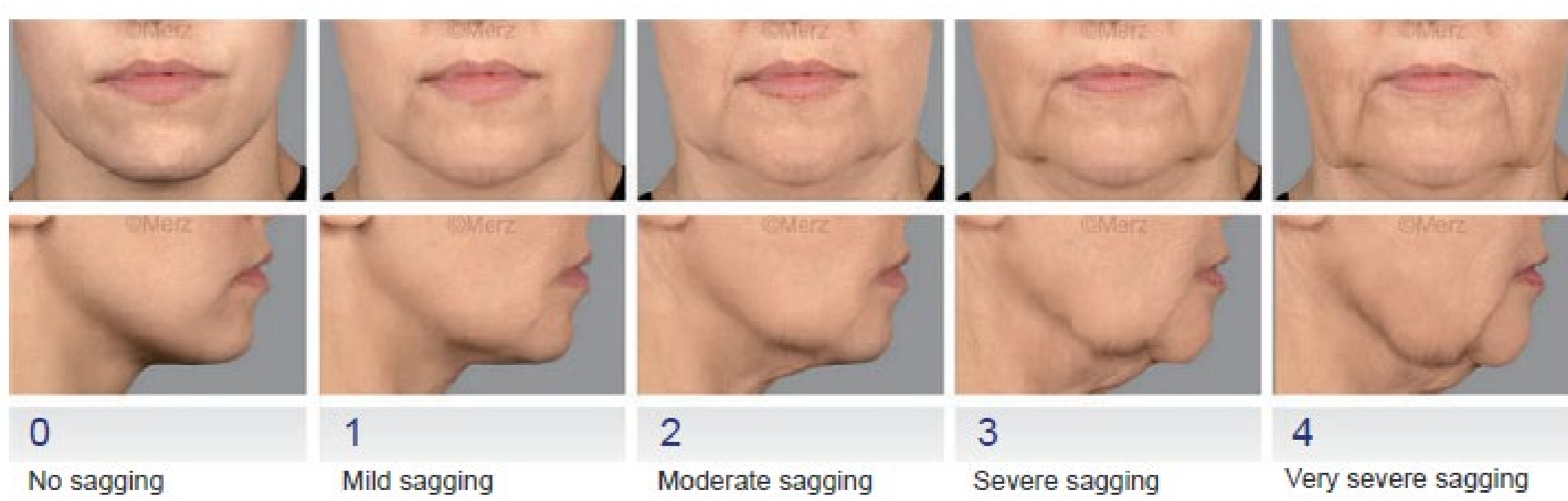
Fig. 2 Merz Aesthetics Scale: a validated, objective, quantitative rating scale for evaluating the esthetic signs of aging

Documented data included age, sex, health issues, treatment indication, injection sites, injection technique, injection depth and the injected volume. The validated photo-numeric 5-point Merz Aesthetics Scale for jawline was used to objectively rate age-related skin changes and evaluate the improvement in baseline scores for midface, lower face and jawline contour (Fig.2)