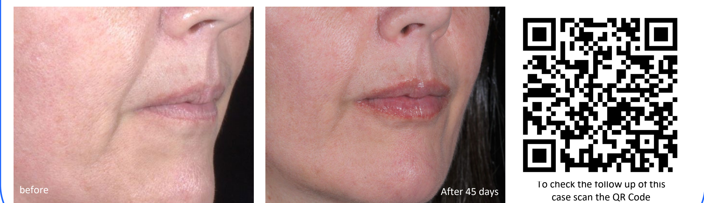
Fig.7 Pictures before and after the treatment

To check the follow up of this case scan the QR Code