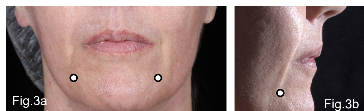
Fig.3 depressor anguli oris: Bot (Fig n°), ulinum toxin injection area. a) frontal view; b) side view